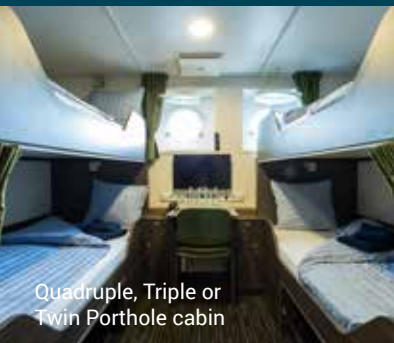
Quadruple, Triple or Twin Porthole cabin